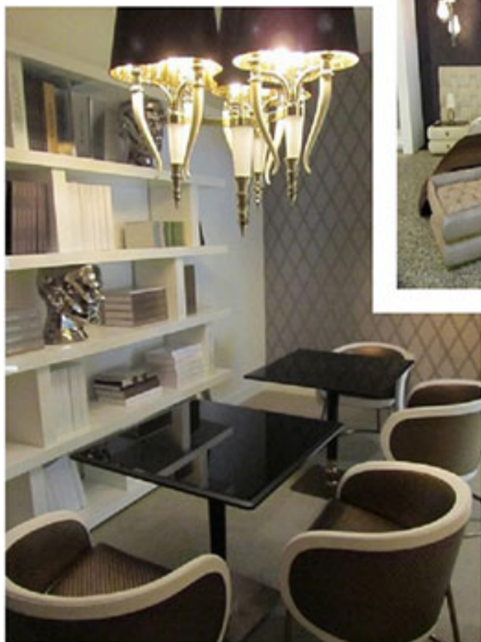
THE VISIONNAIRE SPACE IN LOS ANGELES, LOCATED INSIDE A CONCEPT STORE HOSTING EXCELLENT REPRESENTATIVES OF MADE IN ITALY. IN THE CORNER DISPLAY, A SELECTION OF FURNISHINGS FOR THE LIVING, DINING, OFFICE AND BEDROOM AREAS.